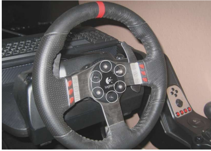
Remove these 6 screws from the original wheel using a 5mm hex key.

Do not use a powered screwdriver during the installation. It is important to proceed slowly when threading screws into plastic to avoid damaging the plastic. Always try to thread the screws into the same grooves made by the factory.