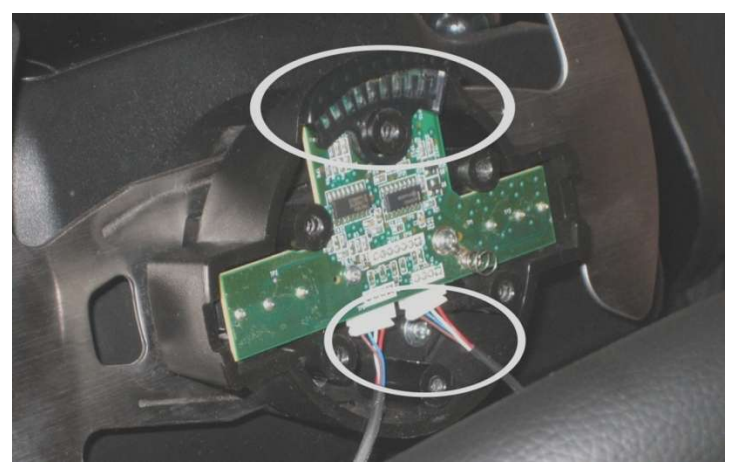
Remove the LED lens piece and unplug the wire harness that go to the wheel buttons.